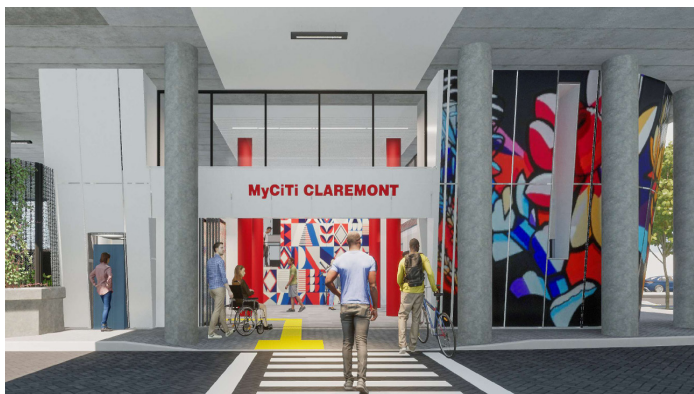
Conceptual illustration showing the entrance design.

proposals was recently undertaken for the station as part of an ongoing commitment to integrating high quality public art into transport infrastructure to uplift the passenger experience while creating an opportunity to celebrate the cultural, historical, and environmental identity of the surrounding communities.